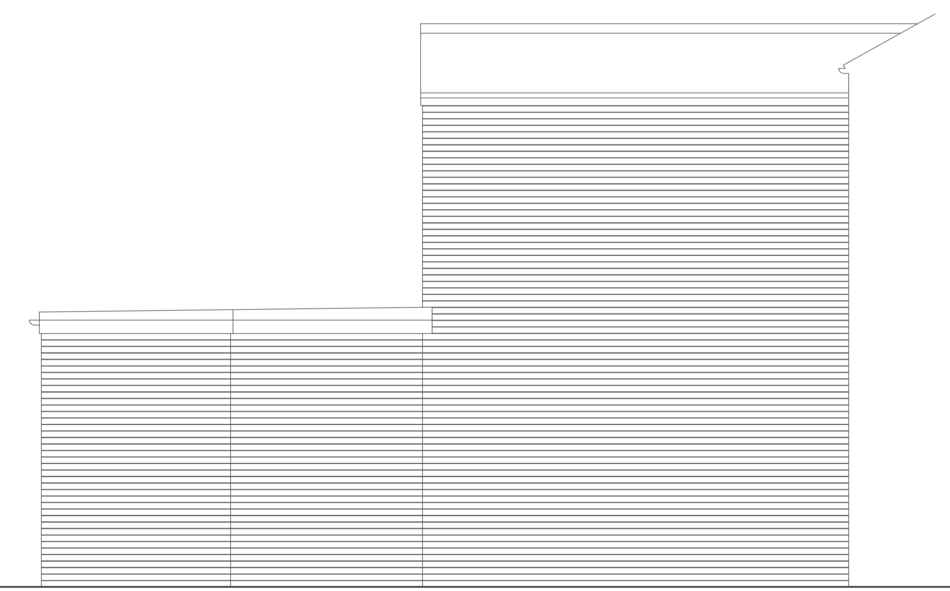
EXISTING REAR SIDE ELEVATION

All drawings are the Copyright of JPL Design and Construct. This drawing may not be copied by any third party without prior permission.